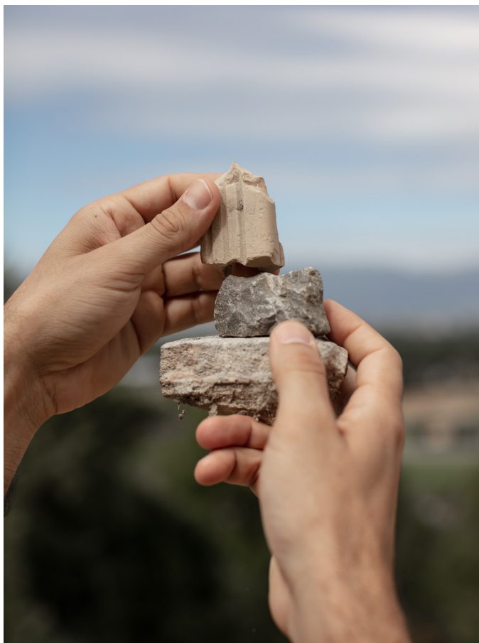
Naissance d'une montagne (Dylan Perrenoud, 2020).